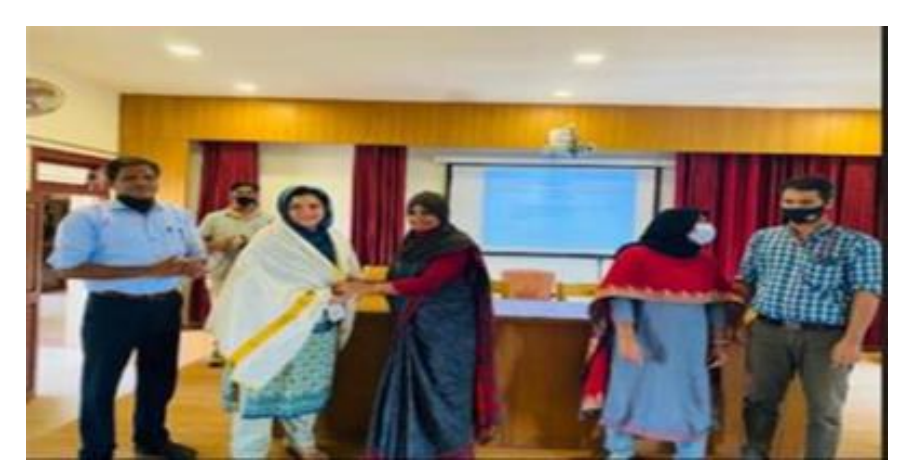
-Honouring the palliative worker-