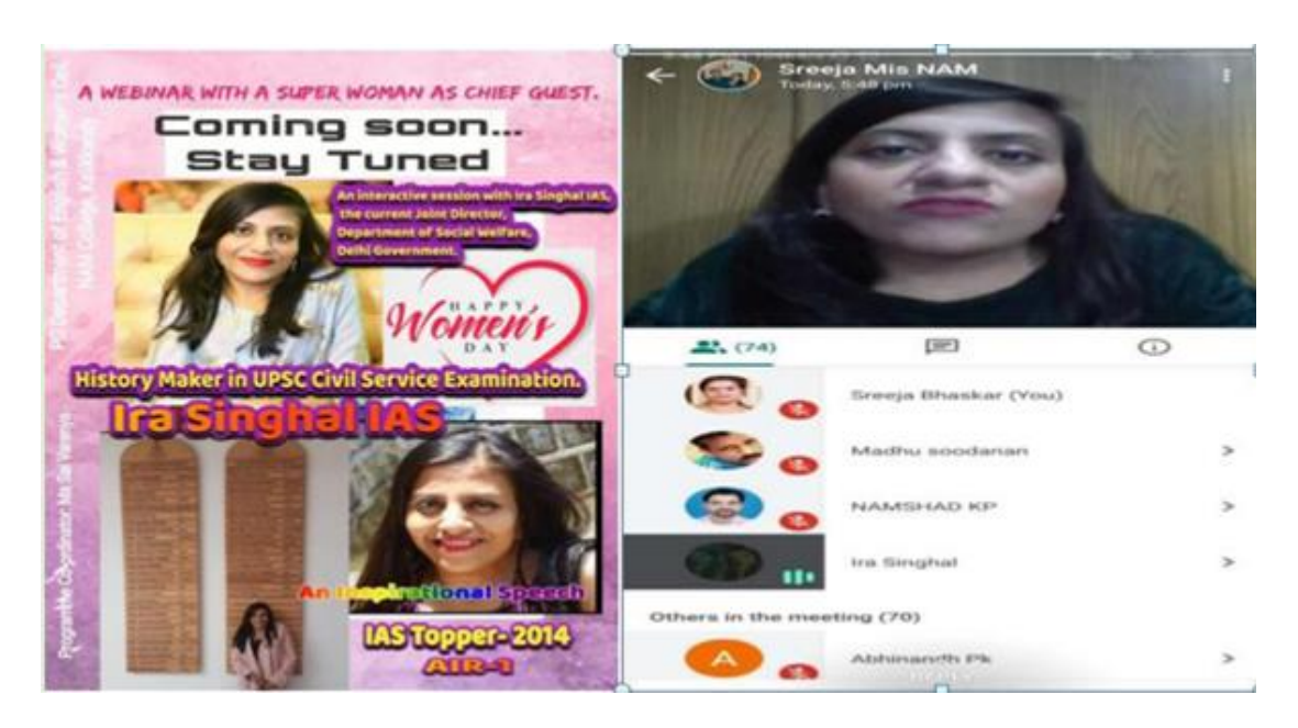
-Webinar on leadership training-

A Webinar on 'Women in Leadership: Life as an IAS Officer', organized by Women Cell in association with PG Department of English and IQAC on 13 March 2021, at 5.30 pm via Google Meet as part of the women's week celebration, 2021. The audience comprised of UG and PG students and Teachers from all Departments of our College.