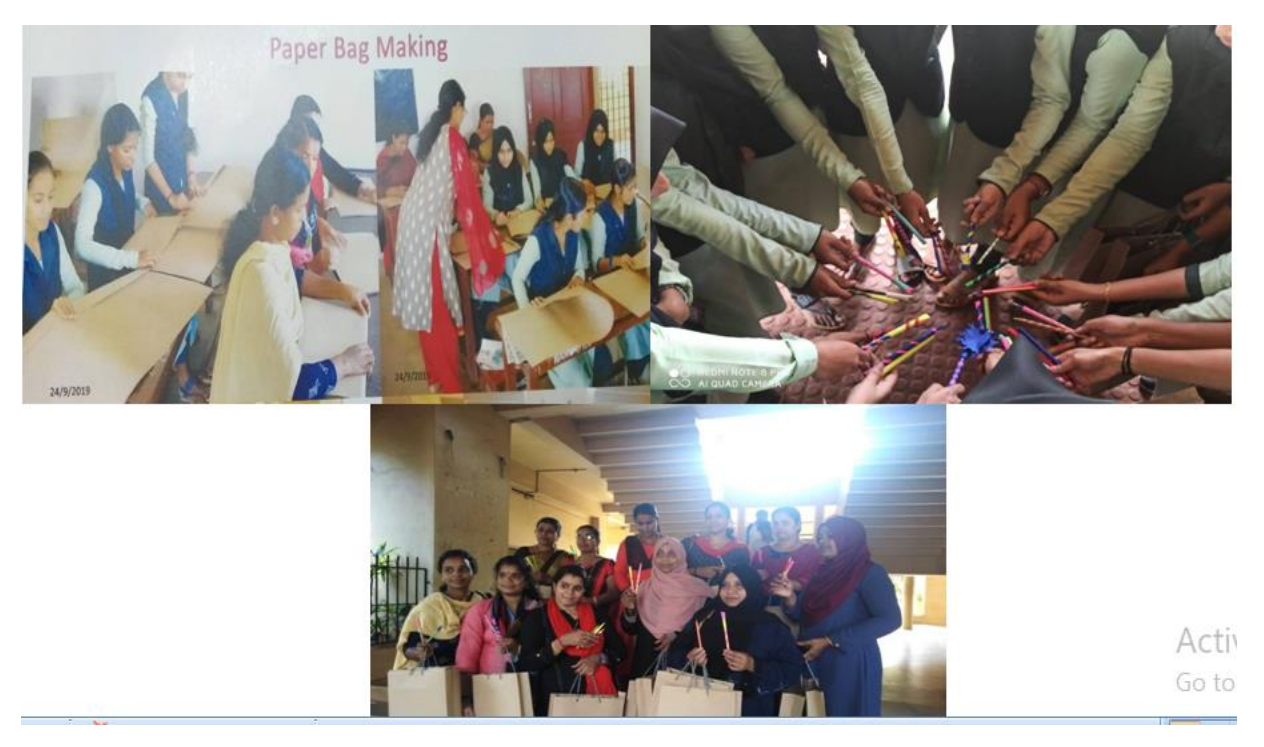
- Paper Bag & Paper Pen making-