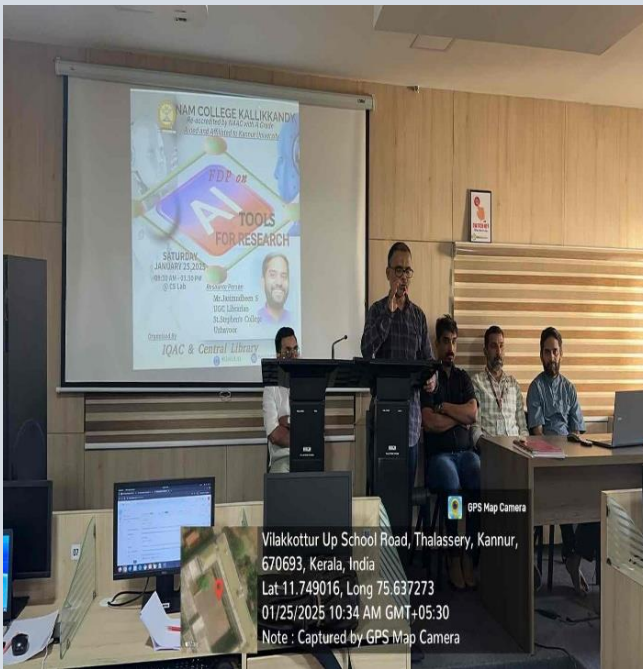
Vilakkottur Up School Road, Thalassery, Kannur, 670693, Kerala, India Lat-11.749016, Long 75.637273 01/25/2025 10:34 AM GMT+05:30 Note : Captured by GPS Map Camera