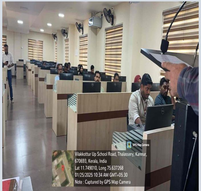
Vilakkottur Up School Road, Thalassery, Kannur, 670693, Kerala, India Lat 11.749010, Long 75.637268 01/25/2025 10:34 AM GMT+05:30 Note : Captured by GPS Map Camera