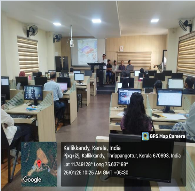
Kallikkandy, Kerala, India Pjxq+j2j, Kallikkandy, Thrippangottur, Kerala 670693, India Lat 11.749128° Long 75.637193° 25/01/25 10:25 AM GMT +05:30